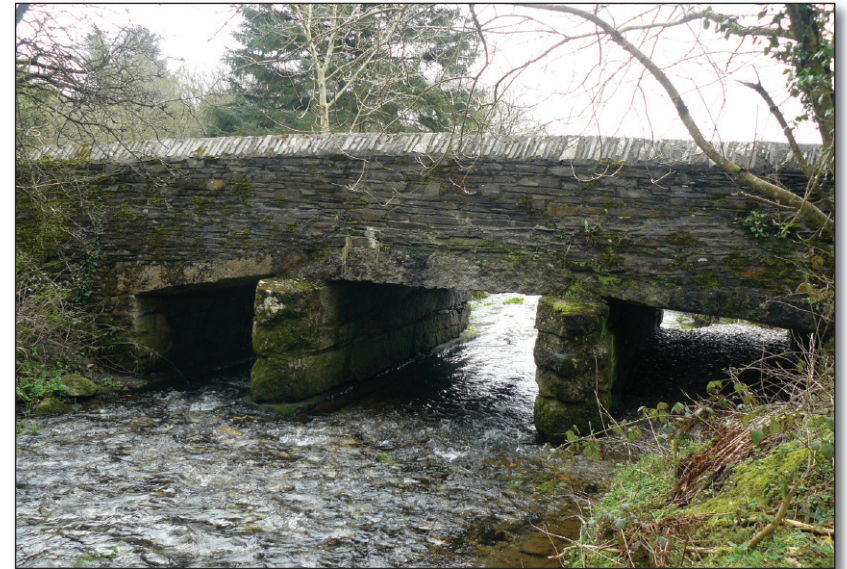
Slaughter Bridge, Camelford, Cornwall.